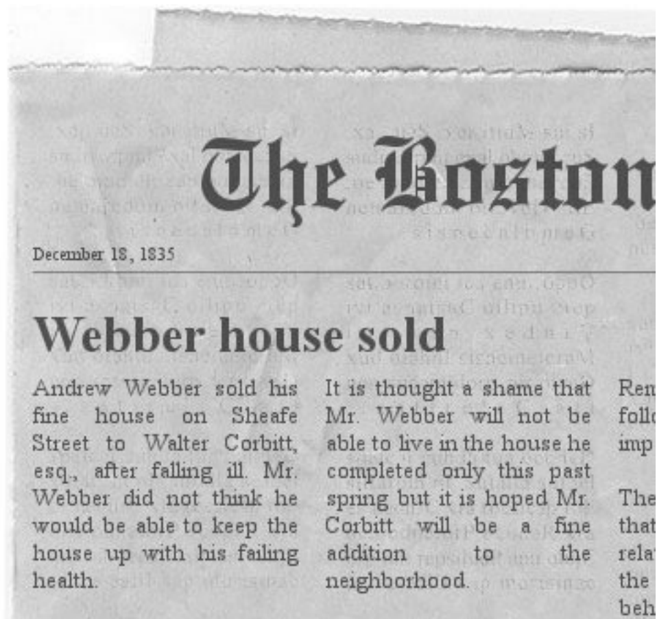
The Haunting - Main Library 1