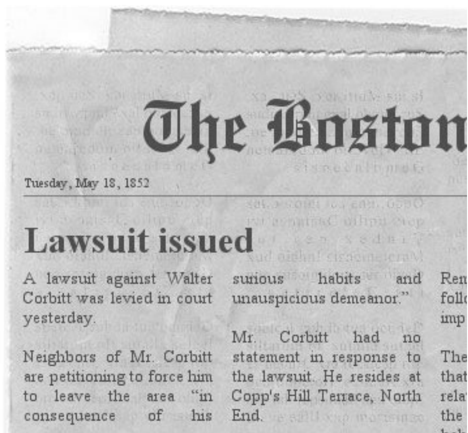
The Haunting Main Library 2