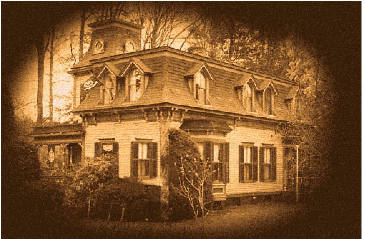
20, Copp's Hill Terrace, North End, Boston